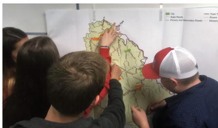
Stories of Place students locating their homes and special places on a map of Martin County.